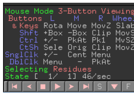
Figure 2 - Default buttons for viewing with a 3-button mouse