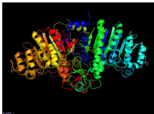
Figure 1 - The end result will look something like this